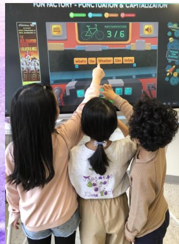
Learning to use punctuation and capital/lowercase letters

And using our skills, we are going to read a famous English story: A Christmas Carol . This story is about a mean, old man who is visited by three ghosts. These ghosts teach him how to be a better person. It is a story that teaches us how to be kinder and more helpful to each other. Have you ever read this story? If not, try to watch the movie!