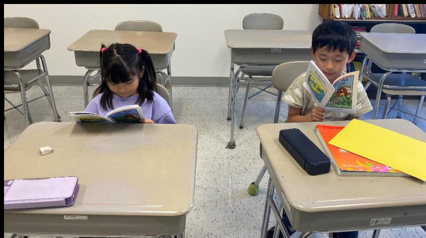
Reading a book about farm animals!