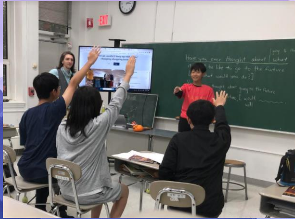
Asking and answering questions about the article

This semester, the ninth-graders have been working on many different skills: inferring, prefixes, suffixes, grammar, and more! One thing that we've been doing to hone all of these skills is to read and dissect newspaper articles. We use a site called NewsELA, which lets you choose what level of English you feel comfortable reading. For example, if you start reading and notice too many difficult words, you can choose to make it easier. While reading, we look for new or challenging words to define, and then we write a summary about what we learned to present to the class. This way, not only do we get to learn about things that we enjoy, but we also get to share them with others.