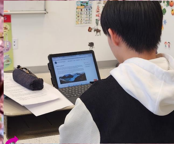
Students doing research & writing papers.

After learning about proper formatting for citations and reference pages, students used the Internet to research their topic and take notes, then composed a summary of their findings as well as opinions and suggestions for how we can better protect our environment.